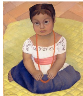
Diego Rivera, Kneeling Child on Yellow Background , 1927