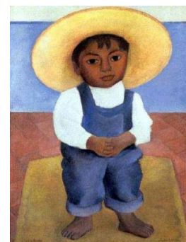
Diego Rivera, Retrato de Ignacio Sanchez, la. 1927