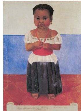
Diego Rivera, Indian Girl with Coral Necklace , 1926